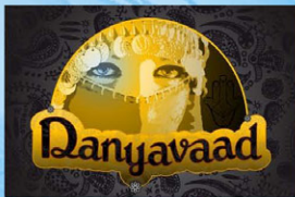
DANYAQAAD Saturday 5PM to 6PM

AL BAHR SHRINE CENTER SAN DIEGO 5440 KEARNY MESA ROAD SAN DIEGO, CA 92111 HWY 163 @ CLAIREMONT MESA BLVD.